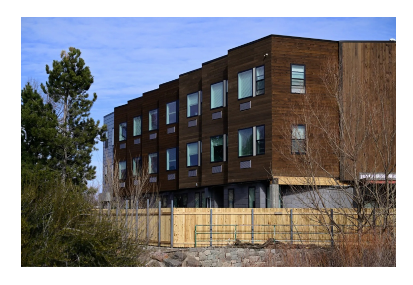
"90% of the folks ... who are unsheltered say they want to be housed.

Bluebird is located at 2445 30th St., and it is the product of a collaboration between the Shelter and Element Properties, the project developer. It provides 40 units of Permanent Supportive Housing, and offers a traumainformed, supportive space for people who have often been unsheltered. To be eligible to live at the facility, potential residents must have